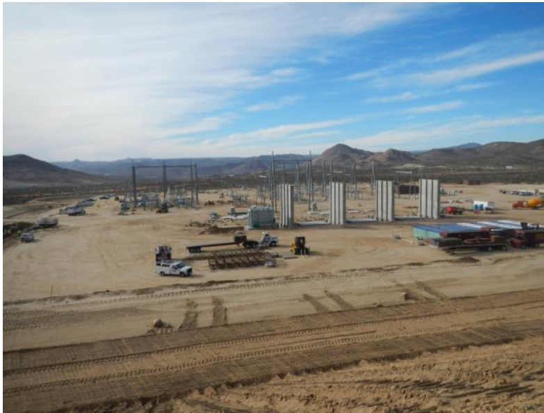
Photo 7: An overview of the ECO substation looking west towards Old Highway 80.