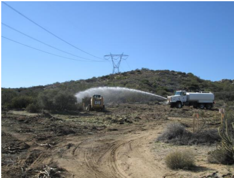
Photo 4: Vegetation being removed within the approved work limits at the pad site for steel pole #65. Work was observed being completed within the approved work limits in accordance with MM-BIO-1a. A water truck was also observed to be present minimizing fugitive dust emissions in accordance with MM-BIO-4a and the Dust Control Plan.