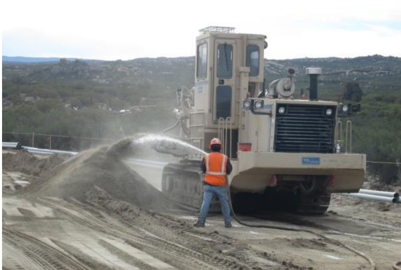
Photo 2: Dust suppression measures consisting of watering down areas of active construction was observed being implemented during trenching activities in accordance with MM-Bio-4a and the Dust Control Plan.

Photo 1: Construction activities associated with pouring concrete foundations at the Boulevard Substation continued during this reporting period. A concrete washout bin was observed being utilized and maintained in good condition in accordance with the SWPPP and MM-HYD-1.