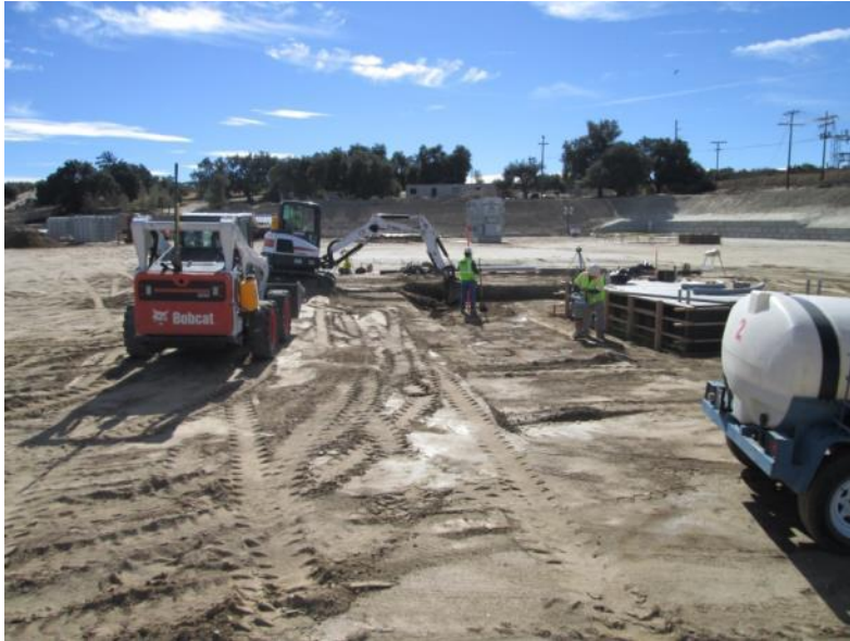
Photo 1: Construction activities associated with pouring concrete foundations at the Boulevard Substation continued during this reporting period. A concrete washout bin was observed being utilized and maintained in good condition in accordance with the SWPPP and MM-HYD-1.