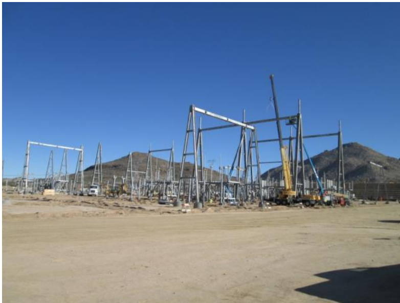
Photo 8: A crane is utilized to erect A-frame structures at the 230 kV bay within the ECO Substation.