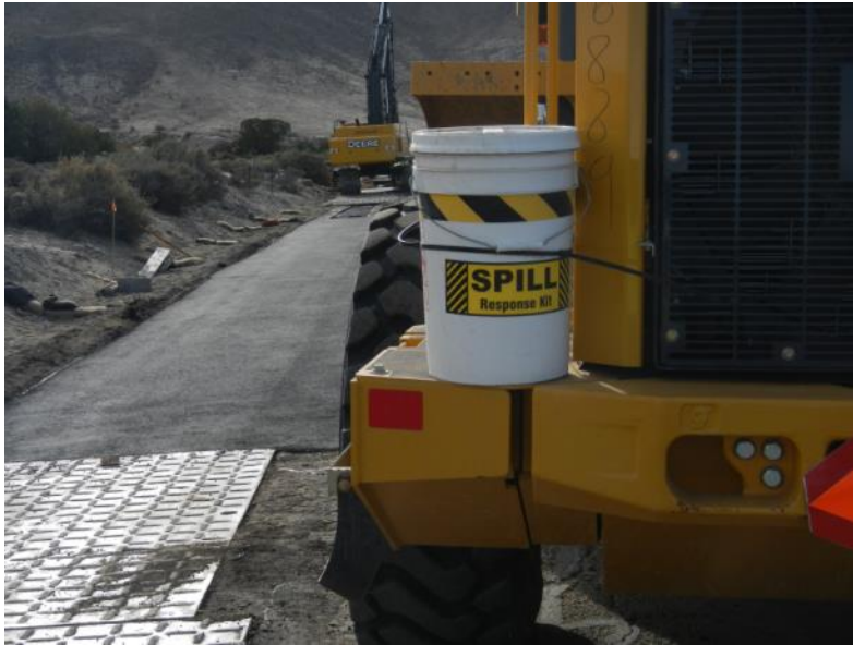
Photo 3: In accordance with MM-HAZ-1a and the Hazardous Materials Management Plan, spill response kits were observed being maintained on construction equipment.