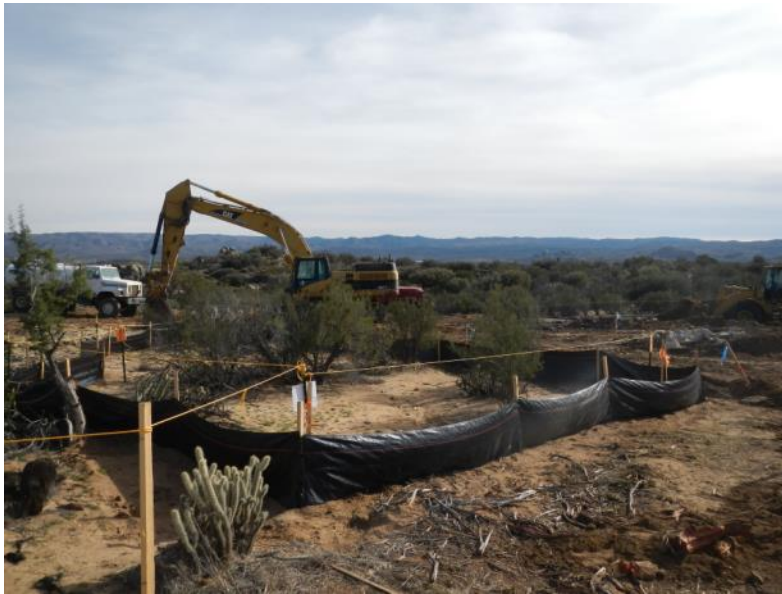
Photo 6: Erosion control measures consisting of silt fence was in place prior to ground disturbance activities and is being maintained at steel pole #64 in accordance with MM-HYD-1 and the SWPPP.