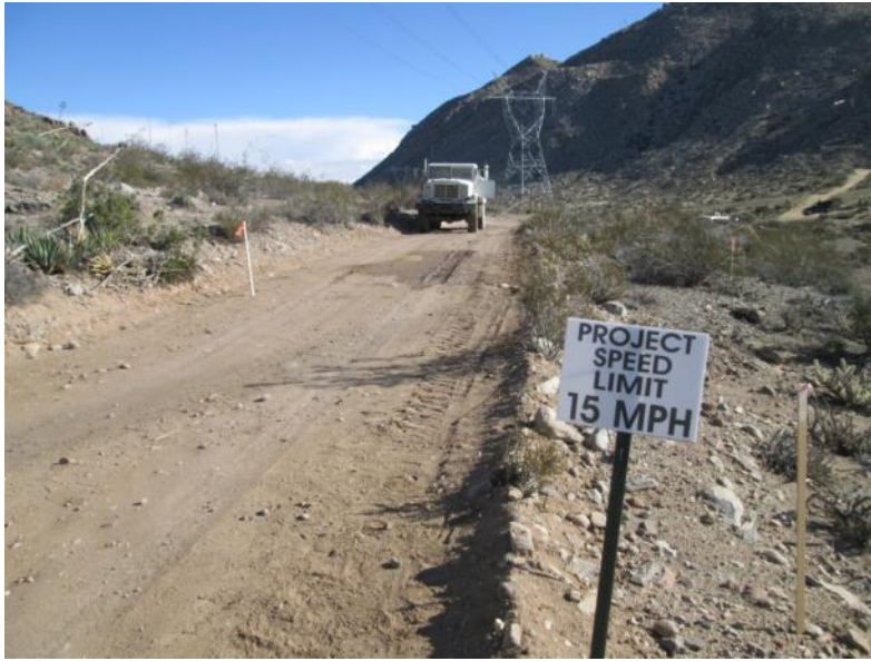
Photo 5: Speed limit signs posted along access roads to remind construction crews to maintain speeds below 15 miles per hour while traveling along unpaved roads in accordance with MM-BIO-7b.